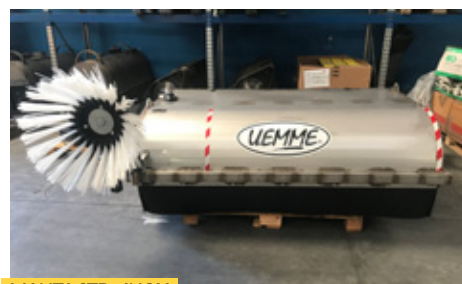
MANTA STD - INOX